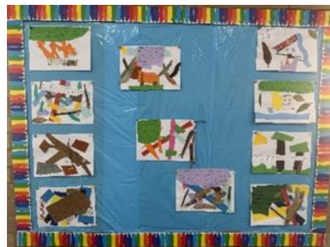
Above: Wabi Sabi – response to text