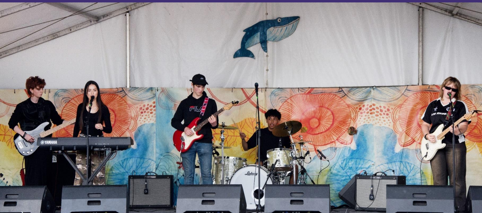
VET Music Students Band '10 Minutes' performing at Crayfest

1 st April 3-6 Division Athletics 30 th April Earth Ed excursion 3-4B & C 2 nd May Earth Ed excursion 3-4A & D 6 th May 3 -6 CDDSA Cross Country, Noorat 16 th May 3-6 Division Cross Country