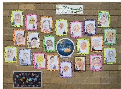
Above: Respectful Relationships – self portraits