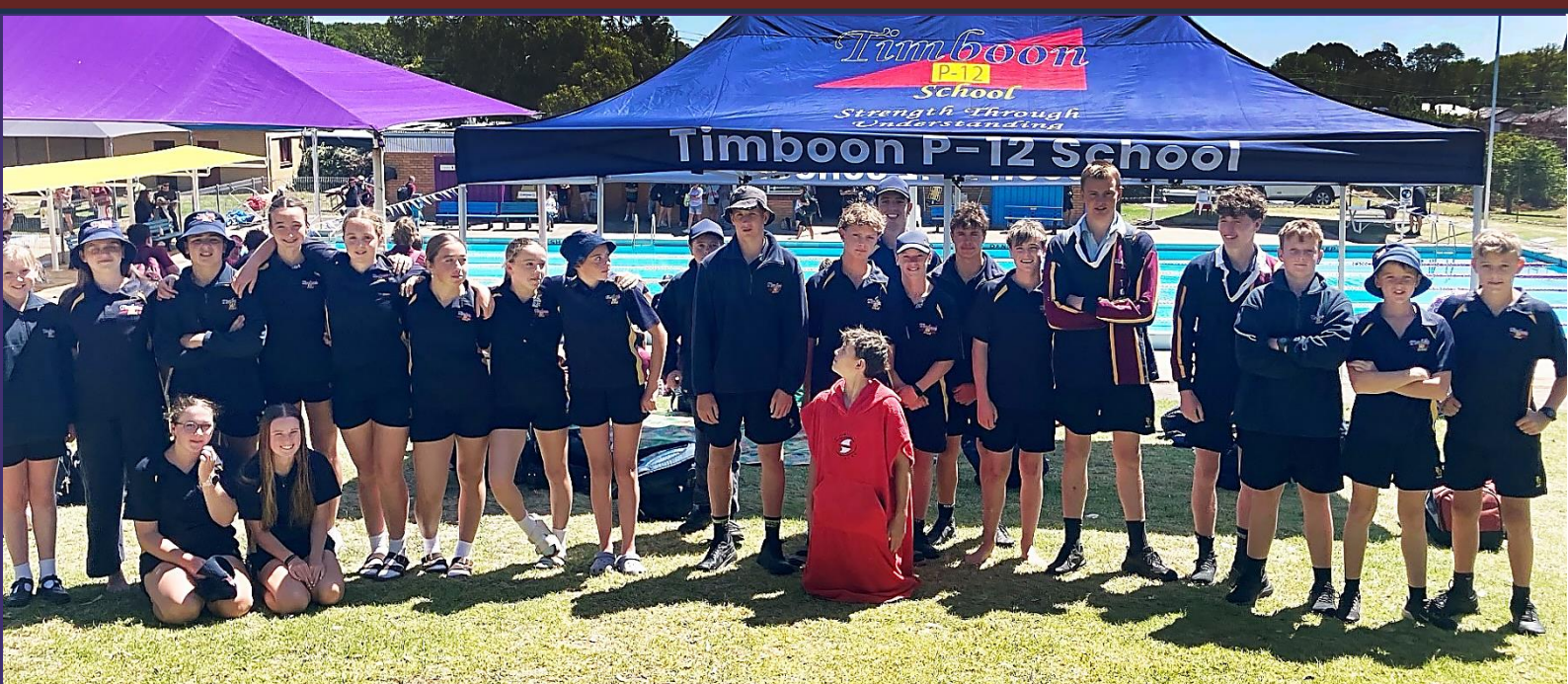
TIMBOON P12 SCHOOL HSSSD SWIM TEAM

1 st May Primary Division Athletics Warrnambool 5 th May 3-6 Cross Country Noorat 15 th May Division Cross Country Warrnambool 17 th May Smile Dental Van