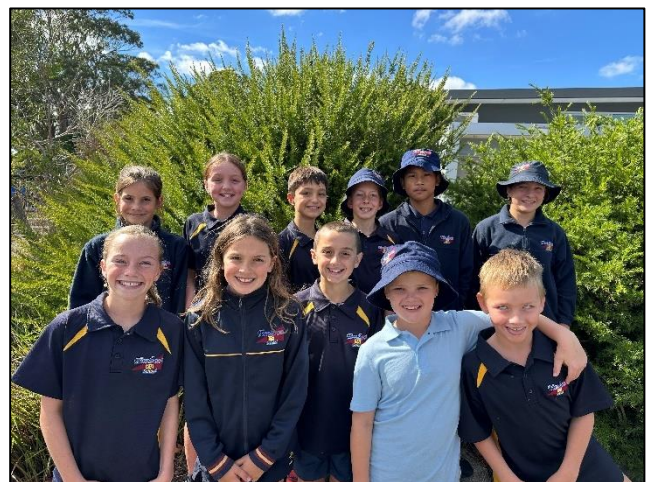
Age group Champions