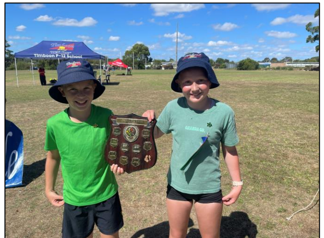
Callaway Captains accepting the winner's shield